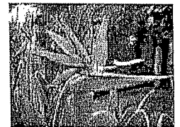
Kirkpatrick, Charles. www.mystory-mysong.com/hawaiian_splendor.htm (2002).

In the picture above, plants are used to create a landscape and the water suggests a river flowing from a mountain. Plants can also be used to imitate animals such as with the Bird of Paradise: